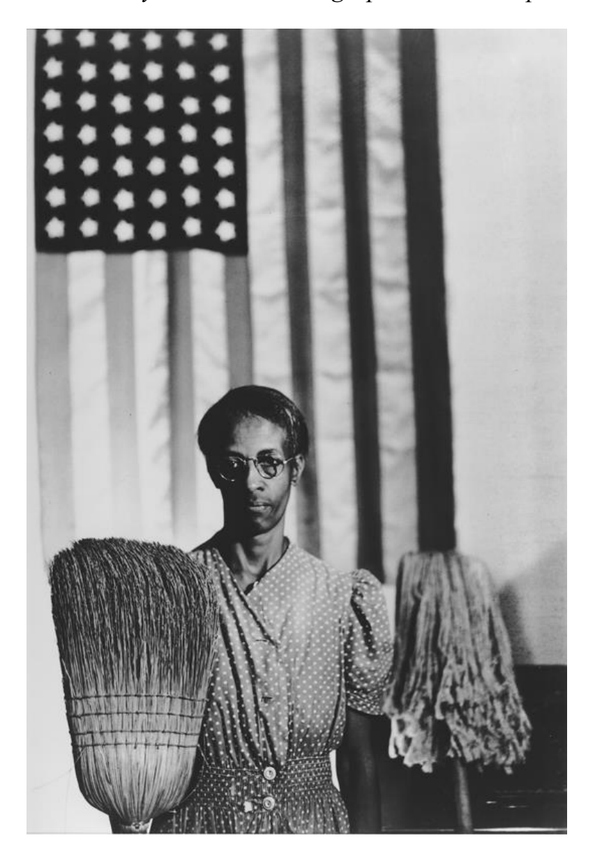
Gordon Parks, American Gothic. 1942

20th Century American Photographers in the Capital Group Foundation Collection